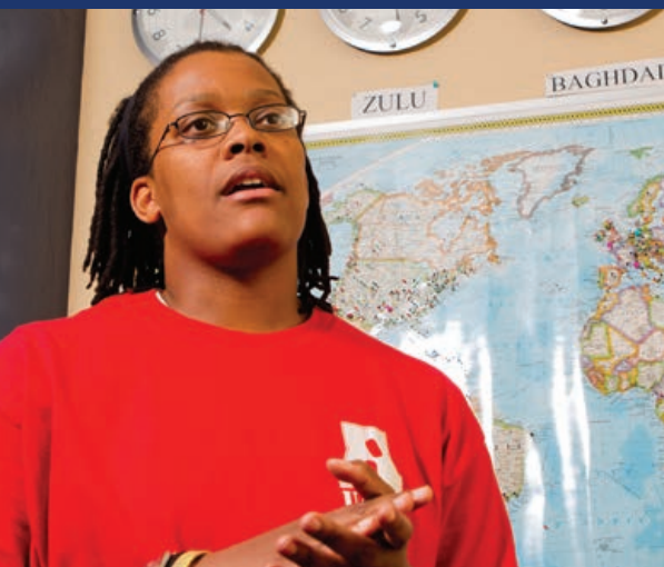
Army stress still lingers: Page 11