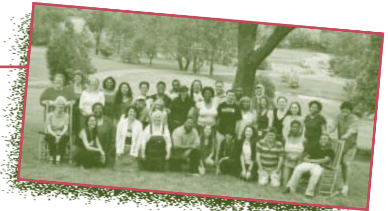
PCN gathering June, 2005

The Progressive Communicators Network exists to strengthen and amplify the power, voices, and vision of grassroots movements that are working for racial, social, economic, and environmental justice. Our members use communication strategy, framing and messaging, and media tools to: 1) enhance the influence of social change movements on public policy and opinion, and 2) realize a world without poverty, racism, and other forms of oppression. The Network is a project of Spirit in Action, a movement-building support organization located in Western Massachusetts.