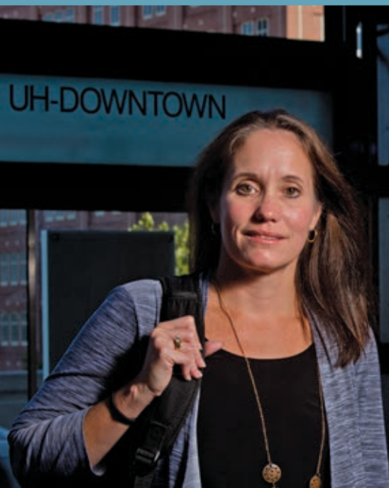
Houston, we're solving a problem: Page 4