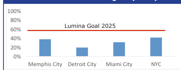
Figure 2: Percentage of Adults with Associate, Bachelor or Professional Degree (2013)