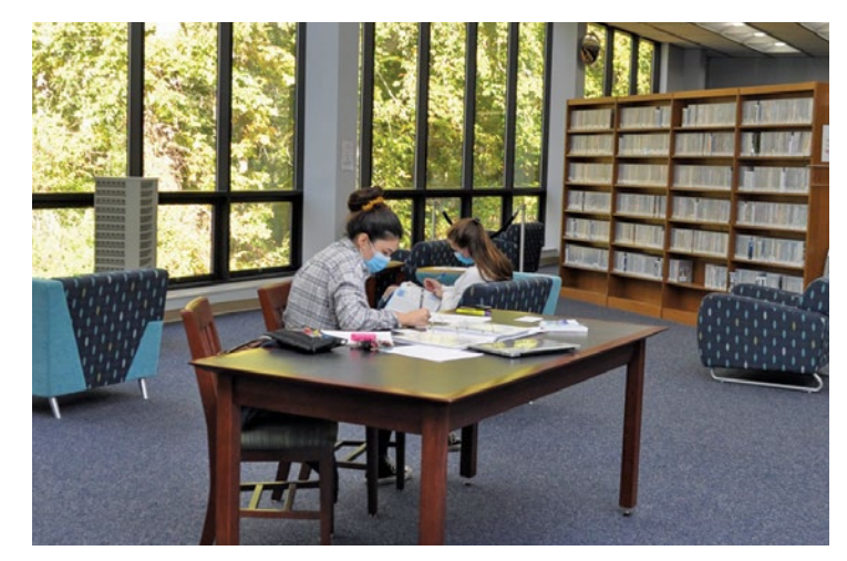
Masked students work in the library at Beaufort County Community College in North Carolina.

In Beaufort, North Carolina, a tier 2 county, most students in the district are first-generation, and 70% of students attending Beaufort County Community College (BCCC) receive Pell grants. BCCC serves a four-county, 2,100 square mile service area in the rural coastal region of eastern North Carolina where