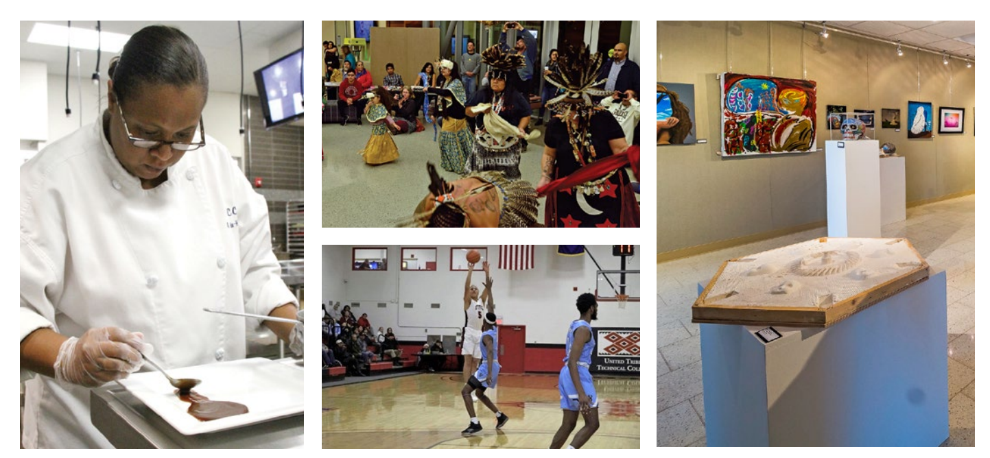
Clockwise: Eastern Iowa Community College Culinary program; Annual Native American Heritage month performance at Mendocino College in California; Art gallery at Taft College in California; Student basketball game at United Tribes Technical College in North Dakota

Despite the myriad difficulties they face, rural community colleges excel at providing wraparound services, not only to their students, but to their entire communities. In addition to providing high-quality education and workforce training, rural community colleges are often a gathering hub and the cultural center of their communities. Many rural campuses feature museums and art galleries, draw large crowds for their sporting events, and host community events. Rural community colleges are often a community's primary or sole provider of essential resources, such as mental health counseling, food banks, Internet access, and transportation. According to research from the North Carolina Small Business Development Fund,<sup>15</sup> education is one of the most important factors in promoting rural economic development. As rural economies transition away from resource based industries such as farming and mining, rural community colleges are uniquely positioned to address the reskilling necessary. Providing open access to both education and support services, rural community colleges play a key role in the success of both rural workforce development and of the overall success of rural communities.