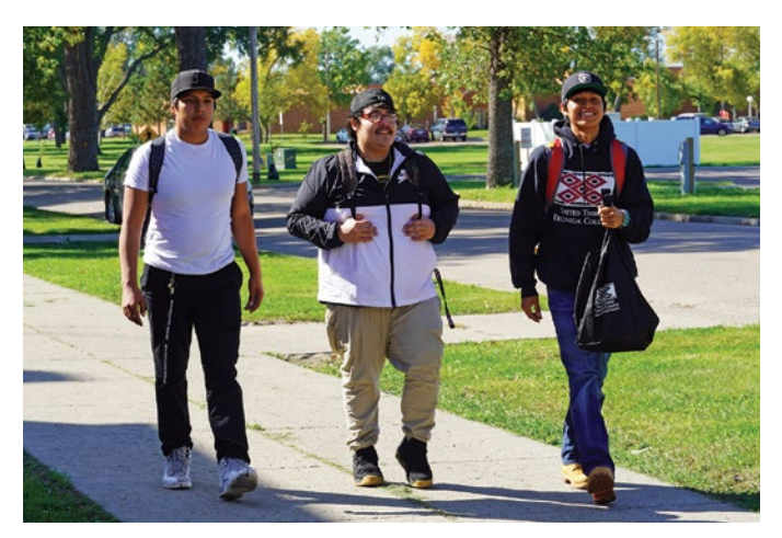
Students at United Tribes Technical College in North Dakota.

It is important that students have this support: 66% of TCU students are first-generation college students, and 80% of TCU students are eligible for federal financial aid.<sup>47</sup> The median household income for TCU students