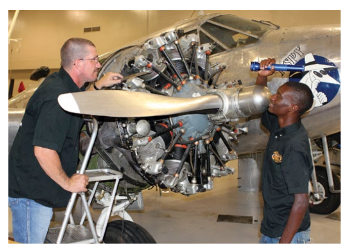
Indian Hills Community College Aviation Program in Iowa

Adjustment Assistance Community College and Career Training (TAACCCT) grant from the U.S. Department of Labor, and partners with The Manufacturing Institute's "Dream It. Do It." program, an initiative that works to change perceptions around careers in advanced manufacturing.<sup>37</sup> Federal funding allowed Iowa community colleges to build capacity, develop state-wide curriculum, and purchase equipment to be able to offer advanced manufacturing degrees and certificates. Working with the IABI and other community partners including private businesses ensure that the curriculum and programming met community workforce needs. Welding was one of the primary needs identified, in addition to industrial maintenance, machining, industrial automation, and robotics. The Elevate Iowa program provides students with scholarships to make this training affordable and puts them in touch with pathway navigators who can help connect them to resources to tackle issues both in and outside of the classroom when needed. The Elevate Iowa program also partners with local school districts to help students and families understand that community college education can put them on a path to a rewarding and stable career.