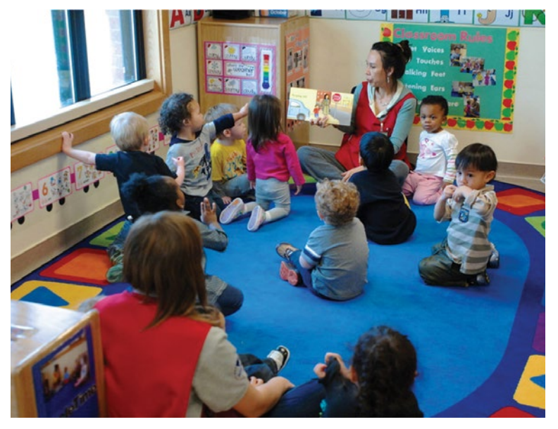
Young learners at Palo Verde College in California

The exact number of rural community colleges in the United States varies based on who is counting. According to the Department of Education, there are 260 rural community colleges in the United States.<sup>12</sup> The Rural Community College Alliance (RCCA) puts the number between 600 and 800.13 This wide disparity can be attributed in part to disagreements over the definition of rural. At the federal level, there are more than a dozen different definitions of rurality,14 based on a variety of factors, from population density to geographic isolation, to socioeconomic indicators. The wide variety of definitions is in many ways appropriate, as it underscores the fact that rural America is not a monolith; however, the different standards complicate assessing rural community college needs. In addition to this complication, the Department of Education definition does not take into account branch campuses when counting rural community college, as RCCA does, nor does it take into account institutions that might serve primarily rural students but are located in a non-rural area.