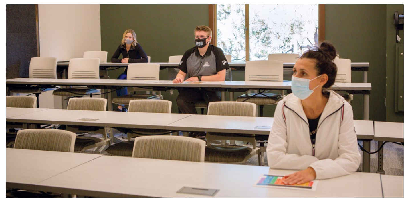
Students sit socially distanced and masked at Lake Tahoe Community College in California

Prior to COVID-19, household incomes in rural areas were close to 20% lower than those in non-rural areas. This gap has widened significantly since the onset of the pandemic, which has had an outsized impact on small businesses, agriculture and other industries that are ubiquitous in rural communities.<sup>1</sup> In the late fall and winter of 2020, COVID cases in non-metropolitan areas far exceeded cases in cities,<sup>2</sup> and when infected, rural communities have worse health outcomes.<sup>3</sup> Rural populations tend to be older, and they are more likely to have underlying health conditions. At the same time, they are less likely to be insured, and less likely to have easy access to hospitals or other options for care.<sup>4</sup> Although telehealth has emerged as a promising workaround for healthcare shortages, this too proves difficult to implement in rural areas, which are less likely to have access to high-speed Internet.<sup>5</sup> Vaccine distribution is lagging in rural areas, and as the rollout continues it is anticipated that this challenge will persist, as retail pharmacies (which are rare in rural areas) are expected to play a larger role in future distribution. The endemic poverty, poor health outcomes, and lack of services already causing devastation in rural communities have been compounded by the pandemic, and have taken their toll on rural community colleges and those they serve.