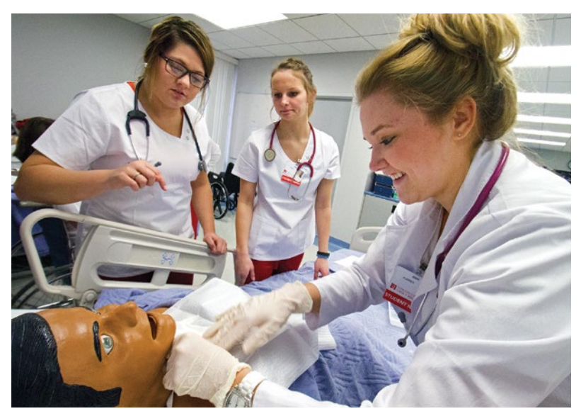
Students in Eastern Iowa Community College's nursing program

Community colleges, regardless of rurality, are chronically underfunded relative to fouryear public institutions. On average, four year public institutions receive almost double the state funding community colleges receive.23 While rural colleges, on average, receive similar funding levels to their urban and suburban peers, the costs of providing service are much higher (as can be seen in the graph on the following page).24 Rural community colleges also have a higher burden of care with regard to student basic support services, as they are often the only provider. Instructional costs can also be higher due to expensive equipment, such as high-tech nursing dummies and medical simulation equipment, a staple of rural college nursing programs that often do not have nearby hospitals to partner with for training.