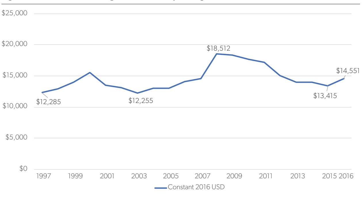
Figure 1. Total Per-Student Higher Education Spending in Ireland, 1997–2016

Note: Includes both government sources of spending and revenue from fees paid by students at public and private institutions. Private institutions of higher education represent a small share of institutions and spending in Ireland; data for only public institutions are not available.